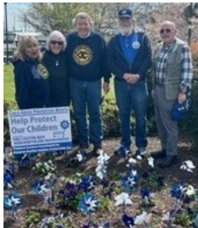
The Exchange Club of Wythe, along with their friends at Hampton University Treasurers Office, partnered with Hampton Healthy Families, Inc. to plant a pinwheel garden at Carousel Park.