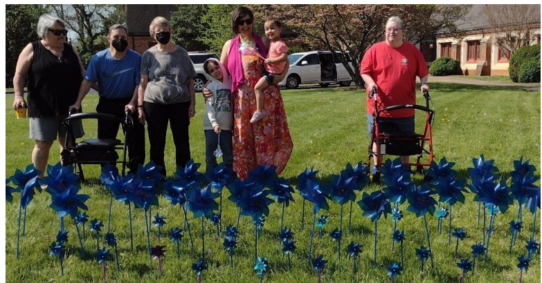
Regional Exchange Club of Lynchburg - Spinning in a local churchyard, these pinwheels reflect the bright future we want for every child.