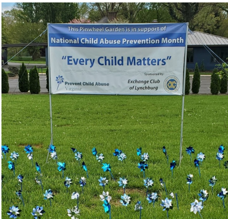
Exchange Club of Lynchburg - Pinwheels prominently planted in front of Karl Miller Real Estate Office on Timberlake Road, a high traffic area.

Pinwheels are used as a physical and touching reminder of the need to protect our children! The displays stay up for the entire month of April.