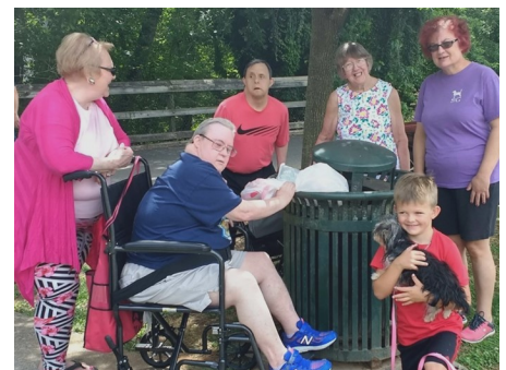
Regional Exchange Club of Lynchburg →