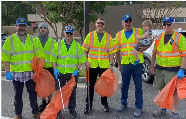
Exchange Club of Poquoson and a future Exchangite!