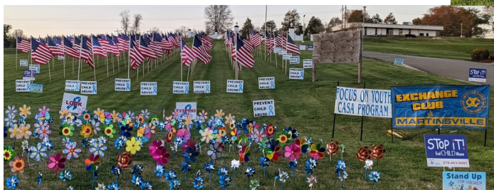
←A large display at Roselawn Burial Park in Martinsville grabs the community's attention that every child deserves to be loved and protected.