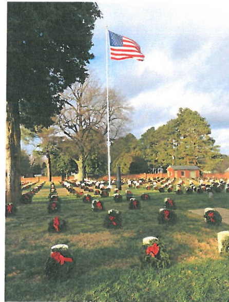
Cold Harbor National Cemetery