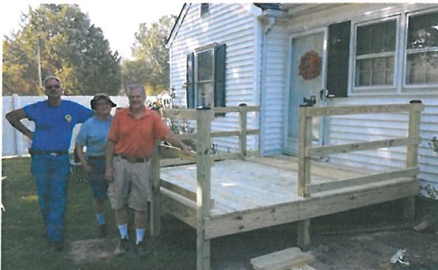
Another Handicap Ramp Completed at 49 Rens Road.