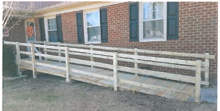
Sixth Ramp Completed this Year at 196 Cedar Road.